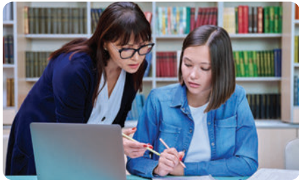
BSB80120 – Graduate Diploma of Management (Learning)

At Monday College , we don't just offer courses; we deliver your direct path to career power. Our dynamic programs are engineered for impact, constantly updated to beat industry standards and focused relentlessly on giving you hard, actionable, hands-on skills. We believe in real-world education—it equips you with the confidence and expertise needed to dominate your field from day one.