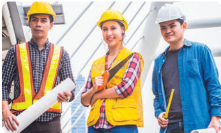
CPC50220 – Diploma of Building and Construction (Building)