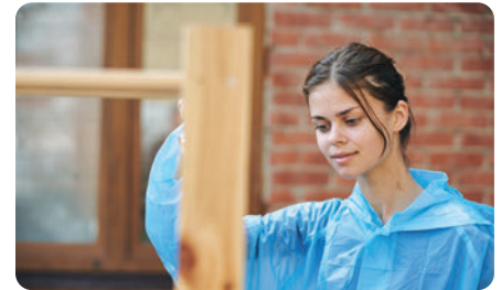
MSF30322 – Certificate III in Cabinet Making and Timber Technology