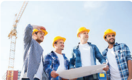
RII50520 – Diploma of Civil Construction Design