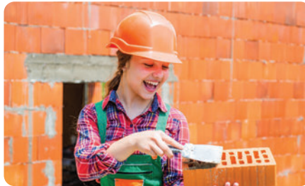
CPC33020 – Certificate III in Bricklaying and Blocklaying